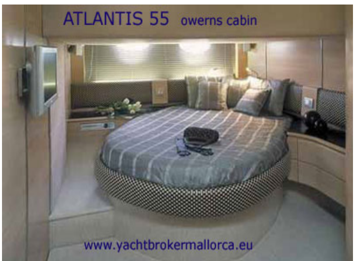
ATLANTIS 55 owners cabin